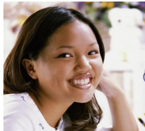
These are not photos of FACS clients

Most children are having regular contact with at least one parent and siblings. Children have more contact with maternal relatives. Kinship carers report more problems with parental behaviour and need more support with contact. However, children in relative/kinship care have more frequent contact with their birth family and reportedly better relationships with them but children in foster care were reported to be as close to their carers as those in relative/kinship care.