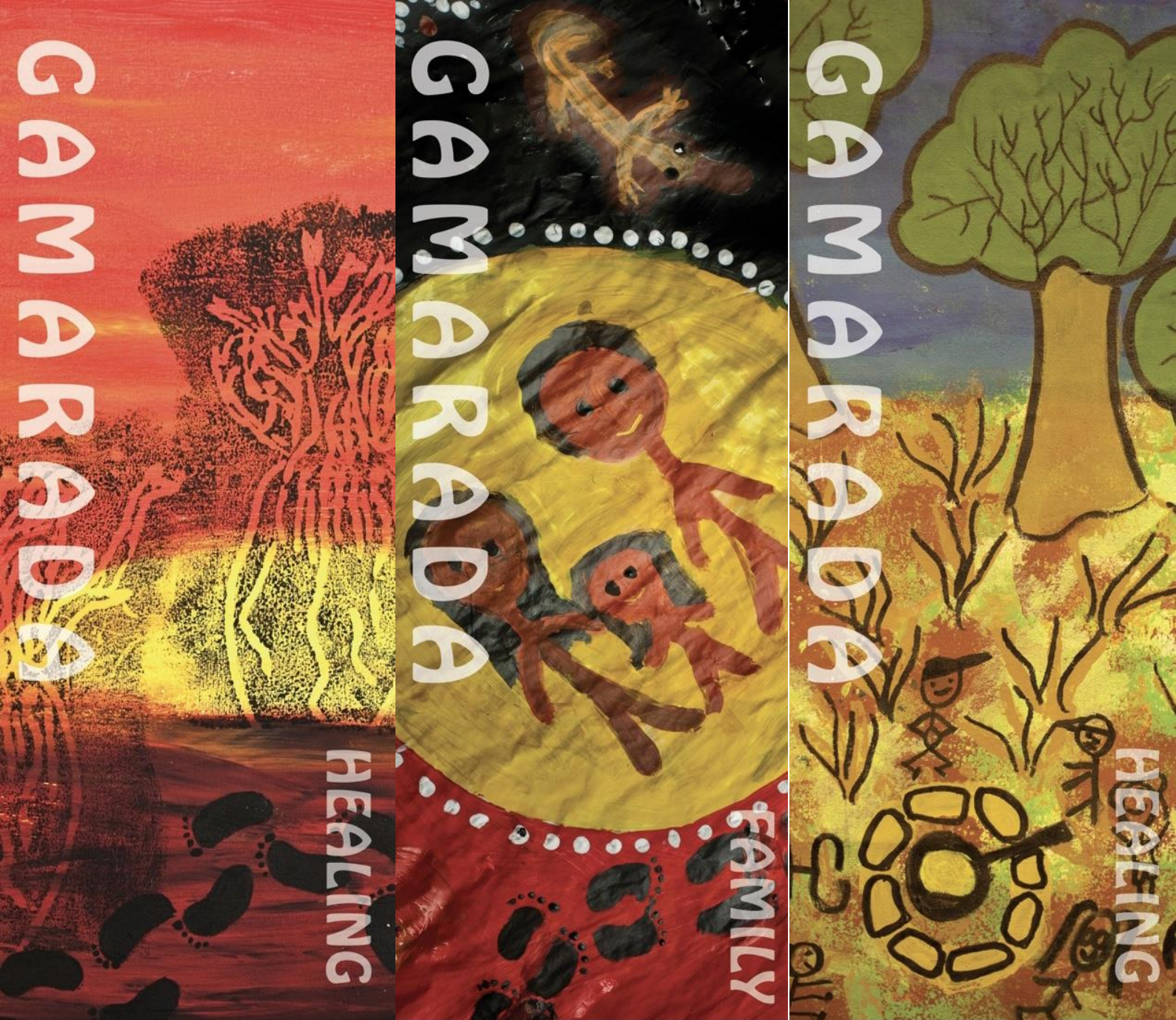
Images from the Gamarada Parental and Community Engagement Program (PaCE) Gamarada means 'comrades or friends with a common purpose' in Gadigal.