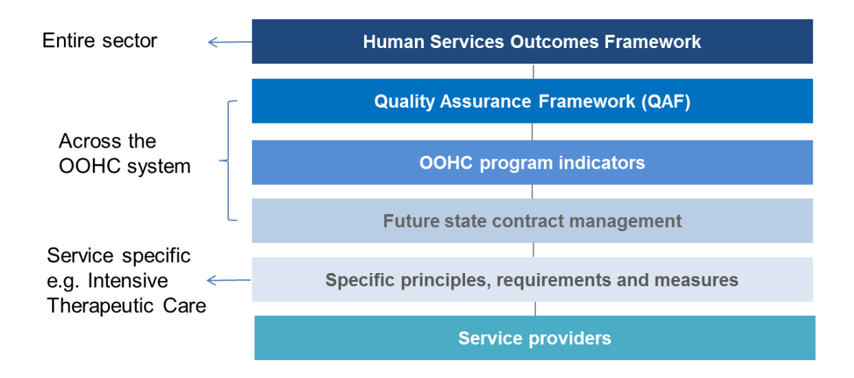
From 1 October 2017, outcomes and indicators will be used to inform financial abatements and incentives for contracted Service Providers. The development of measures for foster care will be influenced by the Quality Assurance Framework trial.

An outcome and monitoring framework provides continuity from the level of broader human services outcomes to service delivery.