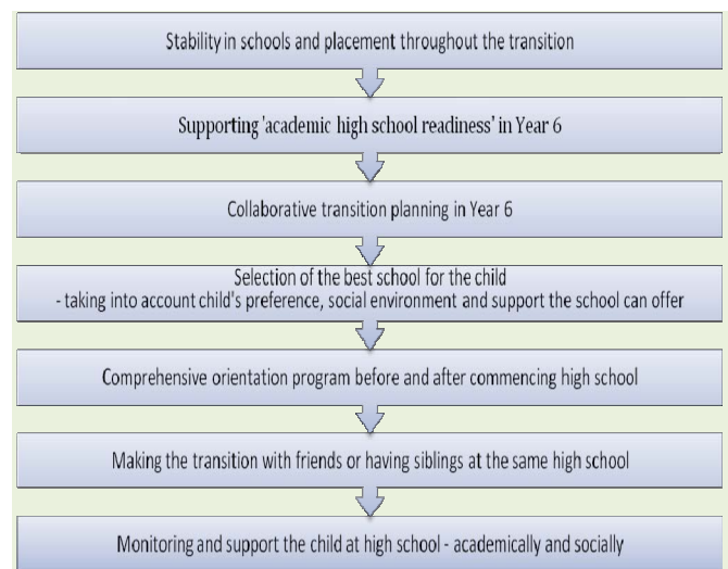
Figure 1: What children and adults say helps the transition to high school?

Figure 1 outlines the strategies that children and adults recommend to support children in care as they make the education to high school.