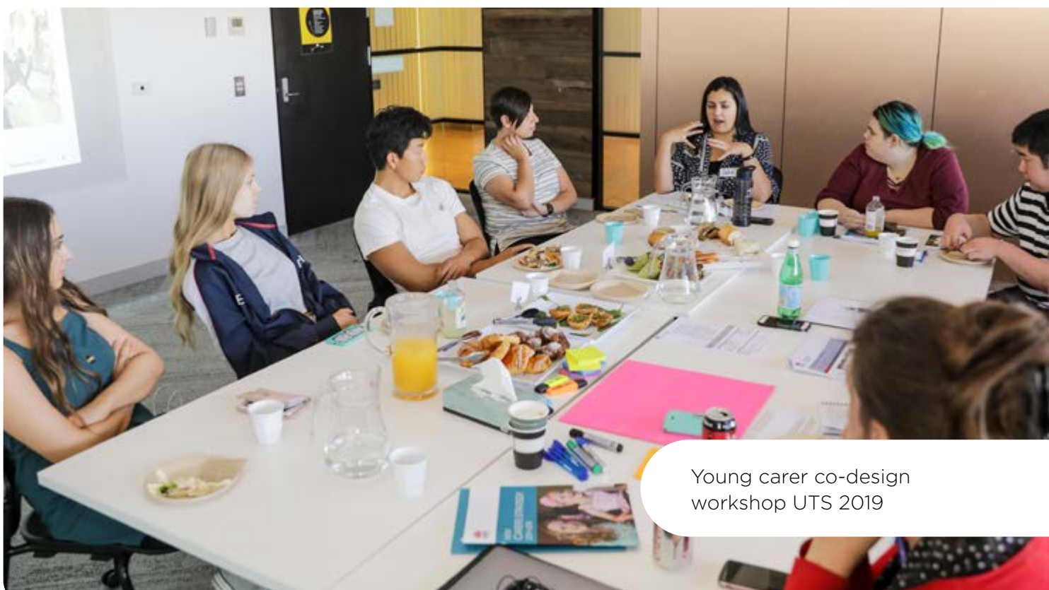
Young carer co-design workshop UTS 2019