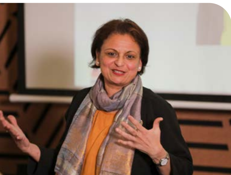
Carer presenting at a carer co-design workshop - Parramatta 2019