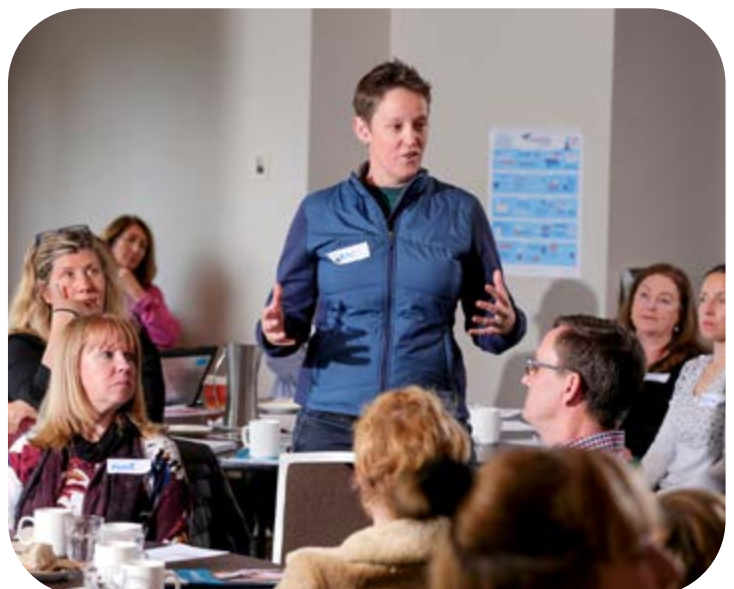
Carer workshop - Sydney CBD 2019

We will continue to use a co-design approach to implement the Strategy over the next ten years, including developing the action plans. We will use a strengths-based and culturally appropriate methodologies to design and implement projects.