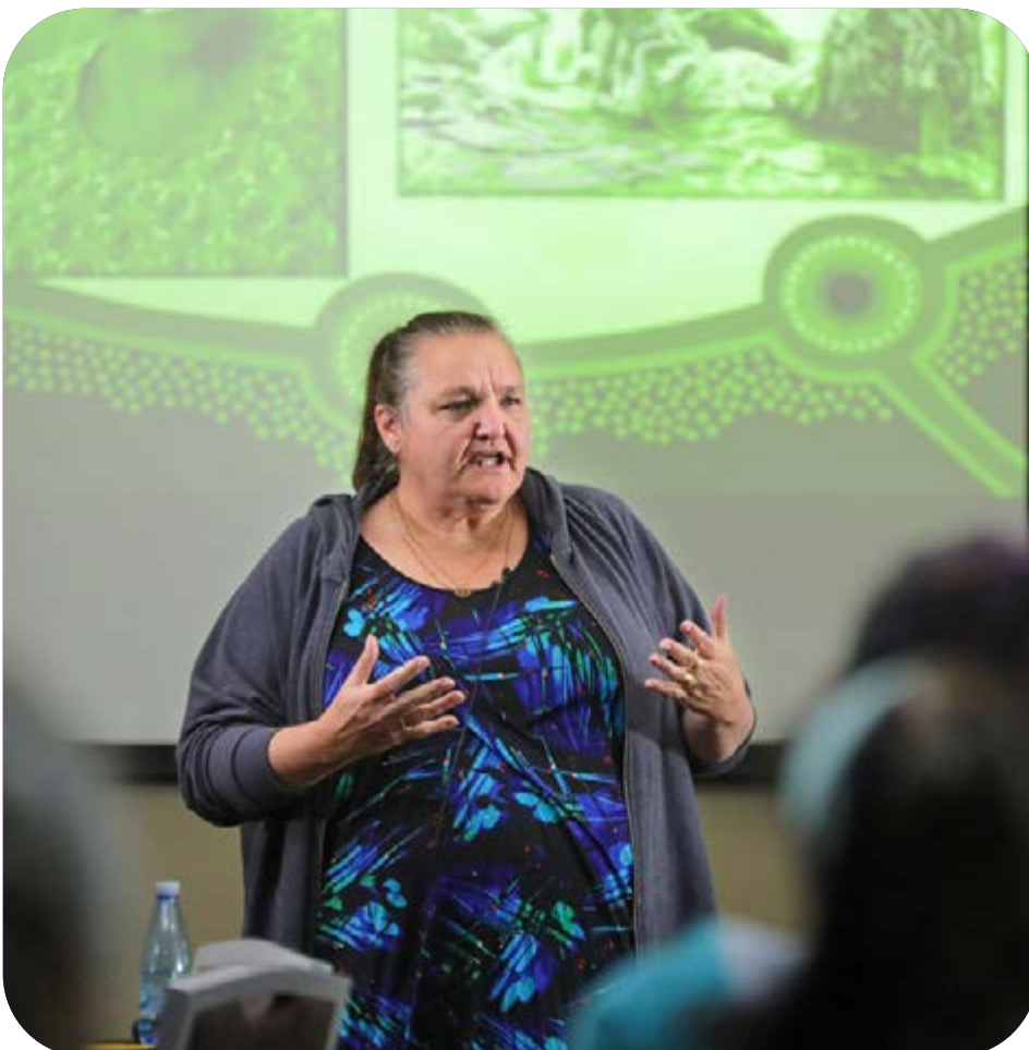
Aboriginal carer presenting at Aboriginal carer co-design workshop Blacktown 2019