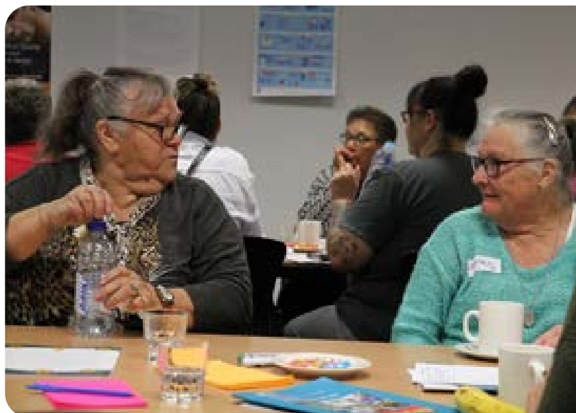
Aboriginal carer co-design workshop - Dubbo 2019

A two stage co-design process to identify diverse carers' needs, priorities and possible solutions commenced in March 2019 and was completed in February 2020. The NSW Carers Advisory Council and the NSW Disability Council were consulted throughout the co-design process.