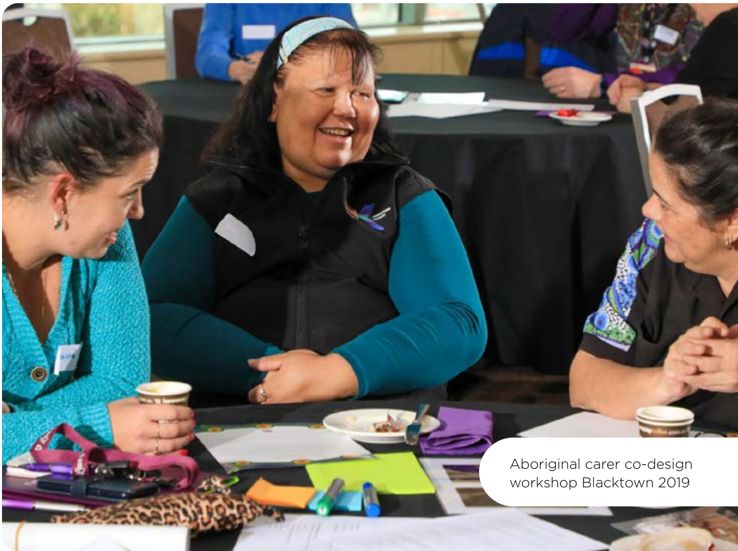
Aboriginal carer co-design workshop Blacktown 2019