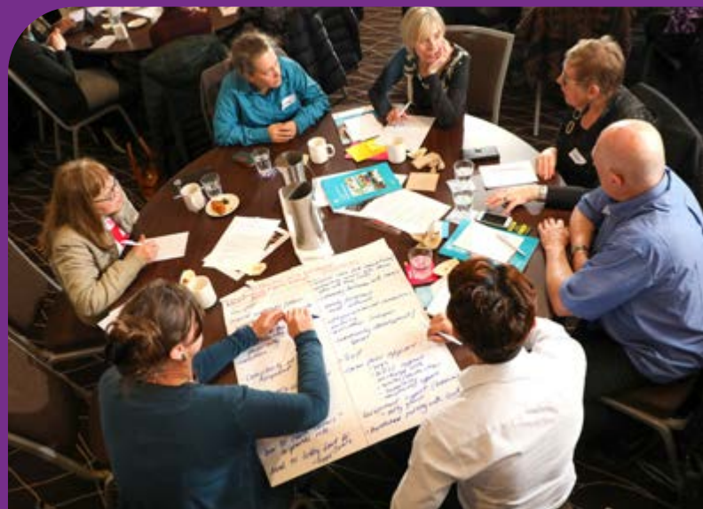
Carer co-design workshop Sydney CBD 2019