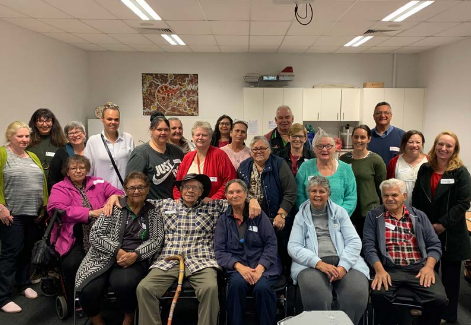
Aboriginal carer co-design workshop – Dubbo 2019